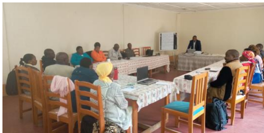
Capacity building training